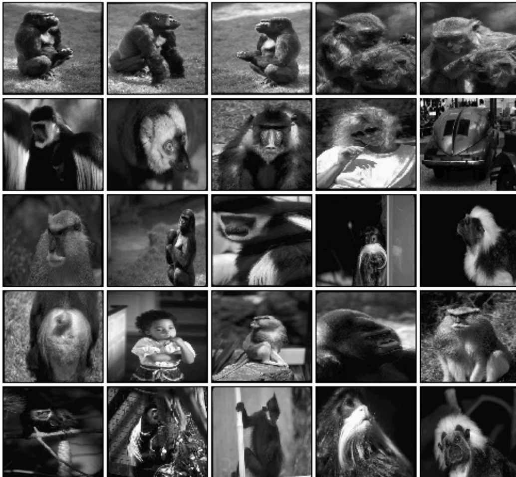
Figure 3. 'Monkey' query results

Unsatisfactory retrieval occurs for several reasons. First it is possible that the query is poorly designed. In this case the user can design a new query and re-submit. Also Synapse allows users to drop any of the displayed results in to a query box and re-submit. Therefore, the user can not only redesign queries on the original image, but also can use any of the result pictures to refine the search. A second source of error is in matching generalized coordinates by value. The choice of scales in the experiments carried out in this case are \frac{3}{\sqrt{2}}, 3, \frac{3}{\sqrt{2}} with the top two invariant vectors i.e. \langle d_3, d_4 \rangle . It is possible that locally the intensity surface may have a very close value, so as to lie within the chosen threshold and thus introduce an incorrect point. By adding more scales or derivatives such errors can be reduced, but at the cost of increased discrimination. Many of these 'false matches' are eliminated in the spatial checking phase. Errors can also occur in the spatial checking phase because it admits much more than a rotational transformation of points with respect to the query configuration. Overall the performance to date has been very satisfactory and we believe that by experimentally evaluating each phase the system can be further improved.