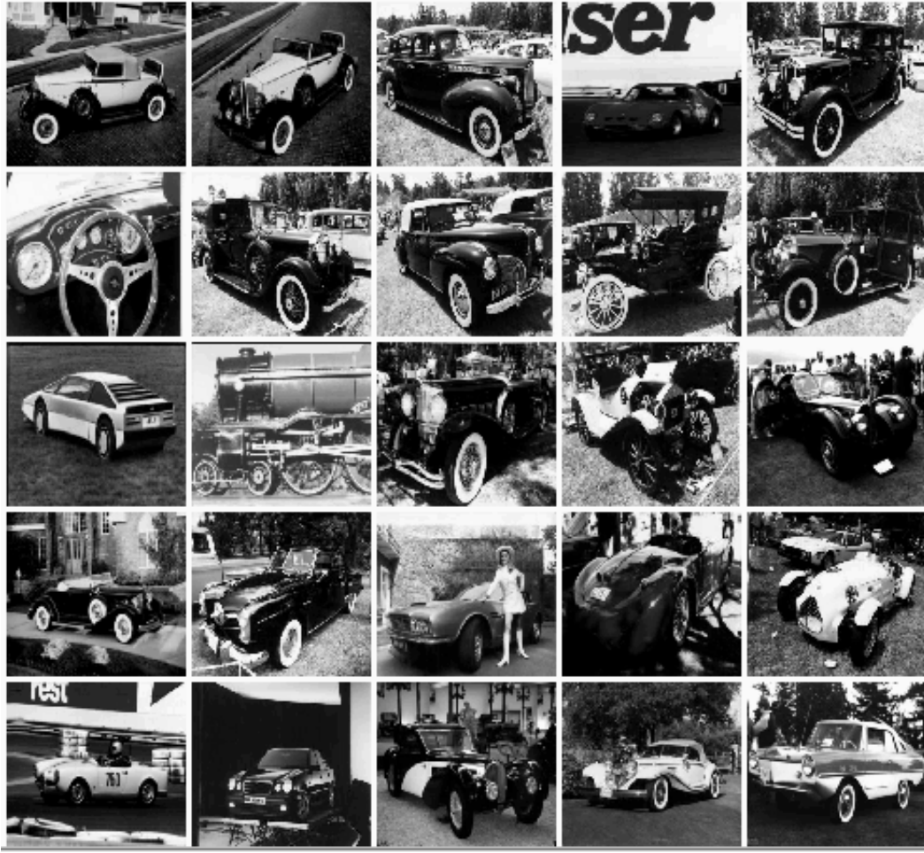
Figure 2. The results of the car query shown in Figure 1(a)

In practice, the fields over which the intersection operation is performed is a matter of experimentation. For example, for several queries and those listed here, the last two fields of the invariant vector are used. This corresponds to six field searches or twelve traversals through the index trees.